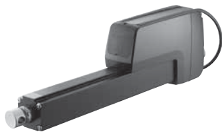
Thomson Electrak® HD Actuator

Performance Testing Standards and Test Procedures v1.0